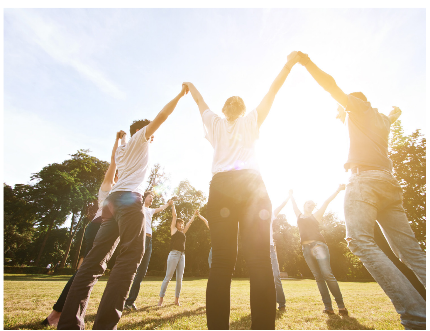
Living Spirit United Church - Drayton Valley AB