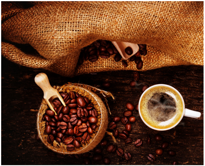
Annual Report 2023 - Final

Our successful application to Fair Trade Canada once again awarded us the designation of "Fair Trade Faith Group Designation" for this year.