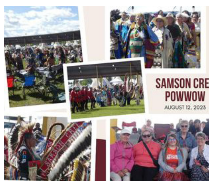
Annual Report 2023 - Final

This event is part of the Strategic Plan of the United Church that highlights three themes: bold discipleship, deep spirituality, and daring justice. The event is a concrete demonstration of the plan's streams of justice, growth, leadership, and Indigenous pathways (it is framed around the Indigenous understanding of the Medicine Wheel). This retreat-event will also contribute to the commitment of The United Church of Canada toward becoming an anti-racist denomination.